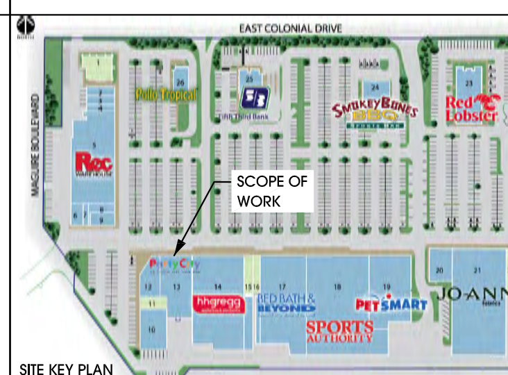
SITE KEY PLAN

COLONIAL LANDING SHOPPING CENTER 3220 EAST COLONIAL BLVD. ORLANDO, FL