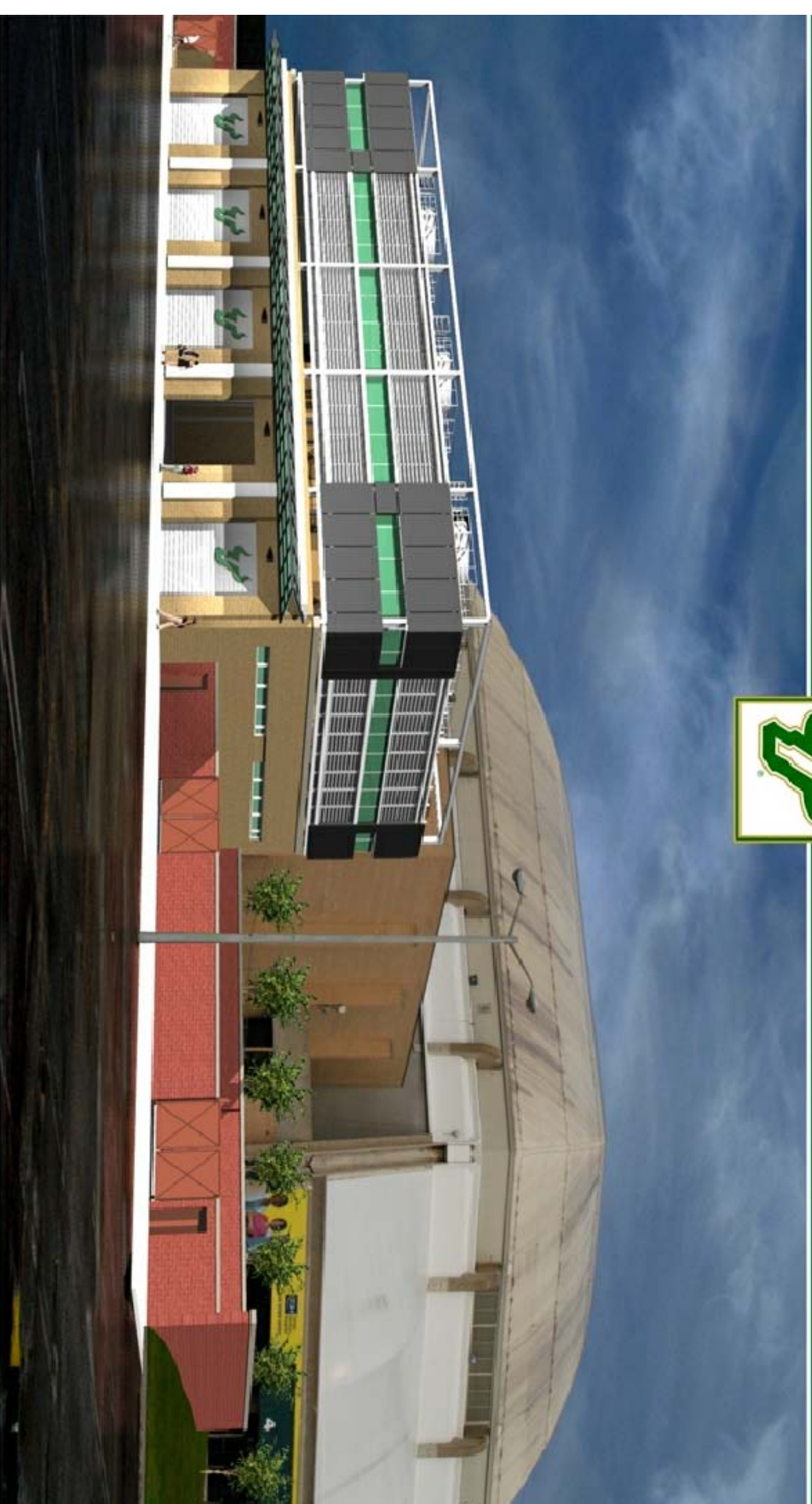
SouthEast Chiller Plant Sun Dome - Corral Extension